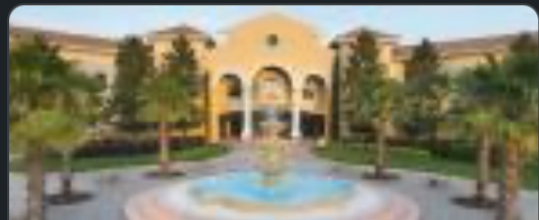
Rosen College of Hospitality Management - UCF